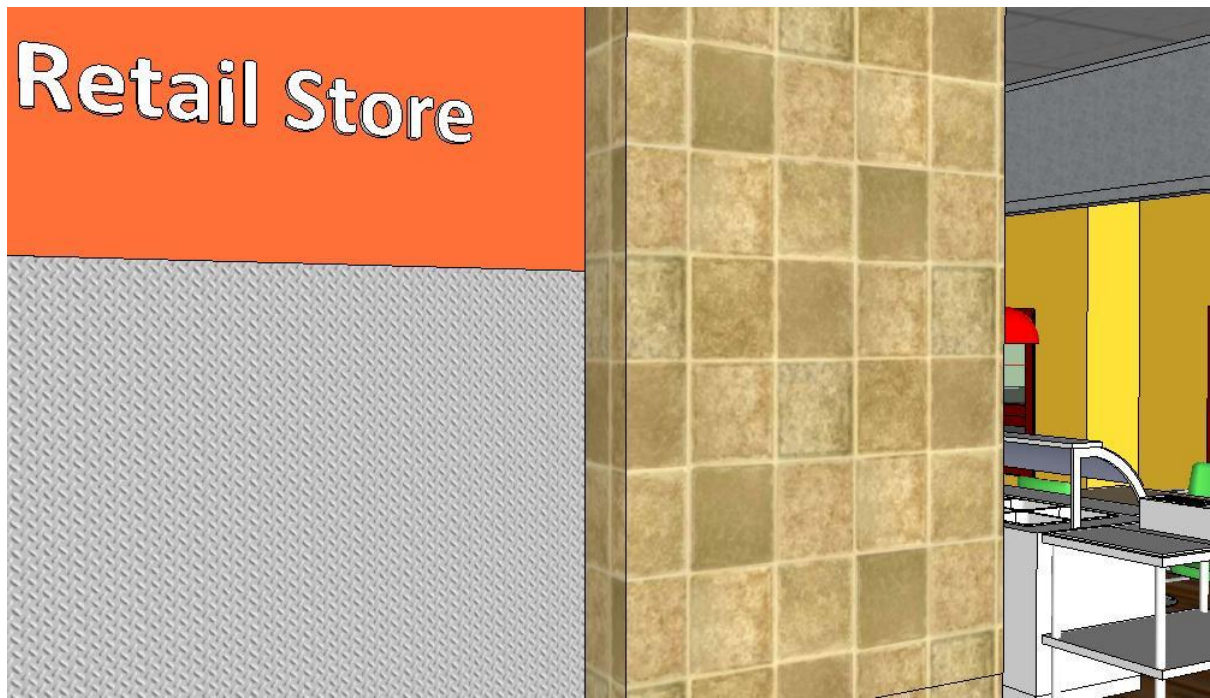
Looking at the retail store at lunchtime, they are nearly always shut.