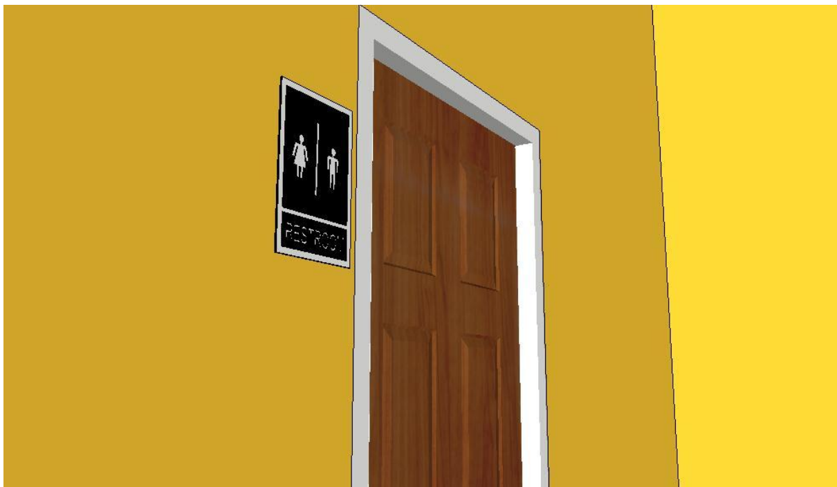
At the back of the Burger King, showing the shared toilet sign.