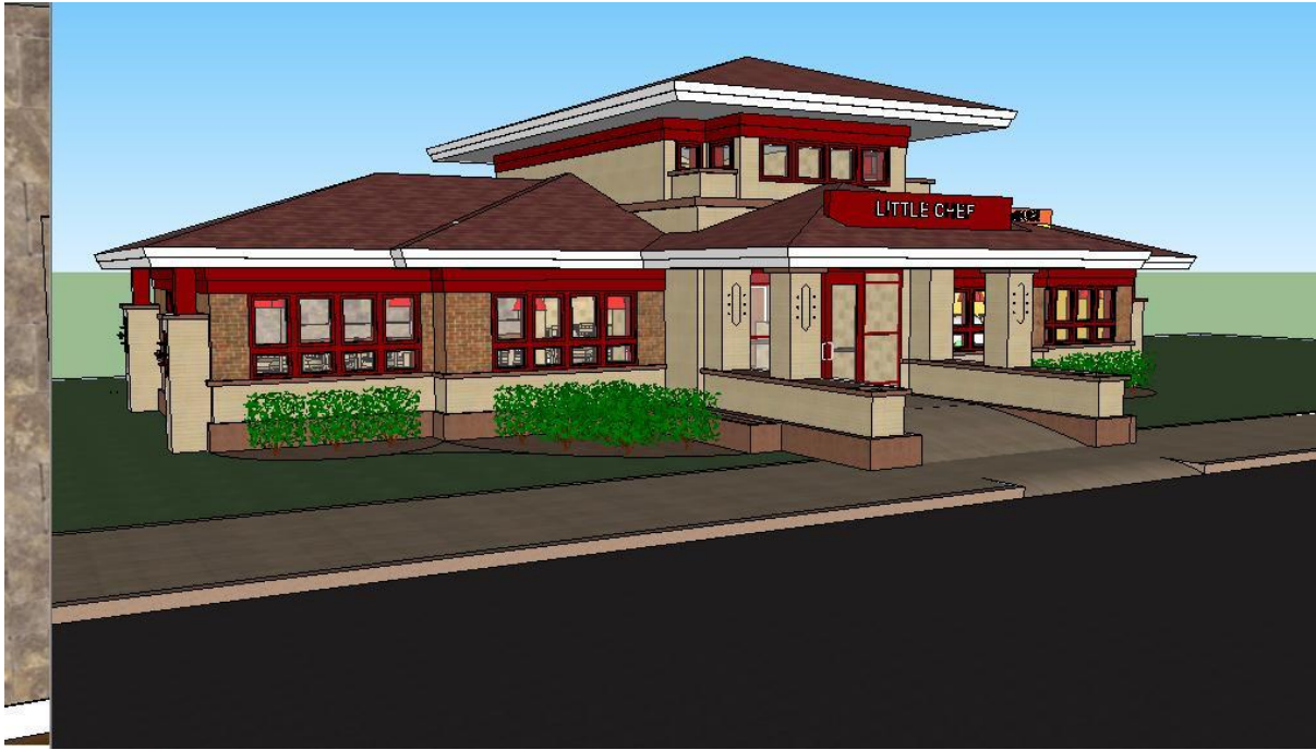
The front of the building, with the Little Chef on the left.