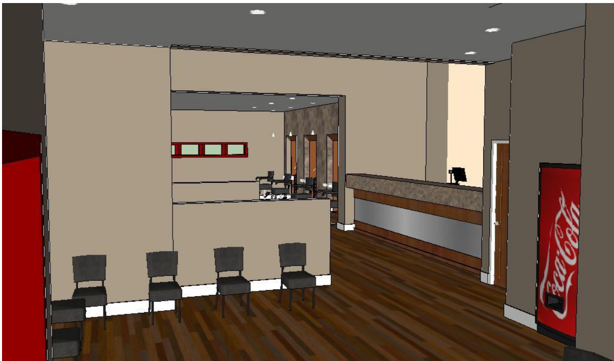
In the former waiting room of the old barbers now lies the burger king.