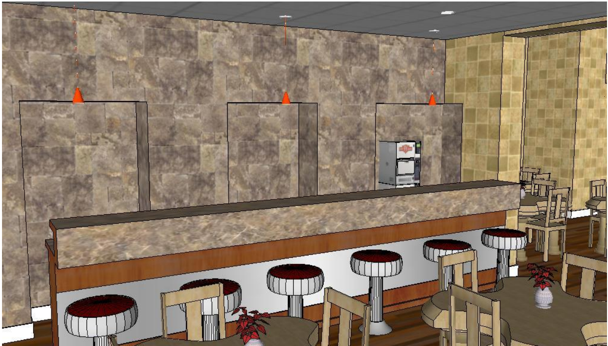
The Little Chef servery. Note the '50's style diner stools.